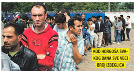
Figure 7: Printscreen, Blic, 2.6.2016, "Increasing Number of Refugees Every Day on the Horgoš Border"

In the administrative frame, visual content has been usually related to statistical data expressed through various graphics, maps, or depicting long queues of people regarding the administration on borders and in camps along the borders (Figure 7).