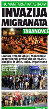
Figure 8: Printscreen, 22.06.2015, Informer , Main headline: "Humanitarian Disaster: Invasion of Migrants. More than 10.000 Refugees from Syria, Iraq and Afghanistan Has Crossed the Border Between Serbia and Macedonia" Image caption: "Unstoppable: Lines of Rushing Towards Belgrade"

Even when they appear in different types of movement, regardless of whether they are captured in arrival towards the camera objective, going away from the viewer's point of view, or just shown as sitting and waiting, the articles' headlines and image titles have often clashed with the visual content itself. Therefore, the text accompanying the image often connotes negative meaning that the image itself does not have. There are numerous examples in the analyzed coverage, where migrants are captured as still and motionless, exhausted and tortured people, while the image caption refers to their "invasion" on borders (Figure 8). In images of interaction, especially with the police, the camera is almost always placed in a way that viewers get the impression that they are looking from the police's, and not from the migrant group's point of view (Figure 9).