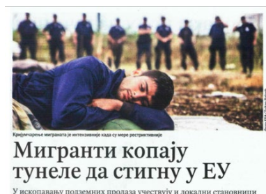
Figure 2: Printscreen, Politika , 30.6.2020, "Migrants Digging Tunnels to Get to the EU"