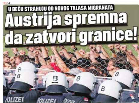
Figure 9: Printscreen, 27.06.2018, Alo , "Vienna Fears from New Migrant Wave: Austria is Getting Ready to Close the Borders!"