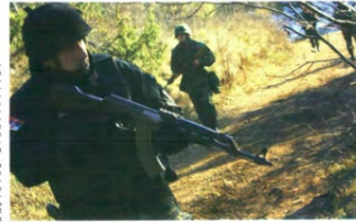
Припадници војске и полиције на задацима

Беој полицијом и граничарима откривено је 142 кријумчара у последних месец и по дана. Полиција је у овом периоду успела да идентификује 142 кријумчара у последних месец и по дана. Полиција је у овом периоду успела да идентификује 142 кријумчара у последних месец и по дана. Полиција је у овом периоду успела да идентификује 142 кријумчара у последних месец и по дана.