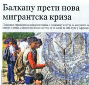
Figure 1: Printscreen, Politika , 18.6.2018, "The Balkans Under the Threat of New Migrant Crisis"

The negative reference to Hungary and its Prime Minister identified in the analyzed coverage during 2015 has been completely different from the most recent media coverage and publicly acknowledged relations between the two countries and their leaders, which have been described as better than ever. Moreover, Serbia has signed an agreement with Hungary and Austria in November 2022 regarding the readmission of migrants which would include sharing expenses and investing "joint efforts to solve the problem of illegal migration" (N1 2022).