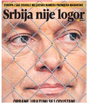
Figure 3: Printscreen, Blic , 19.6.2015, "Serbia Is Not a Concentration Camp. Orban, Get Yourself Together and Give Up"