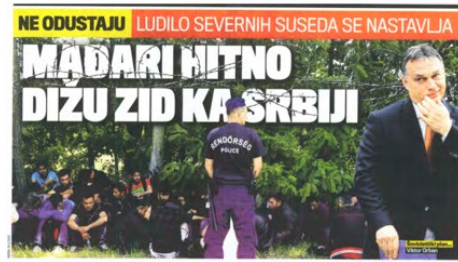
Figure 4: Printscreen, Kurir , 25.5.2015, "They Do Not Give Up: The Craziness of Neighbors on the North Continues. Hungarians Are Urgently Building Up a Wall Towards Serbia. Chauvinistic Plan of Orban"